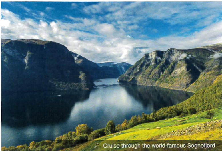
Cruise through the world-famous Sognefjord

cobblestone streets. Nearby, you'll visit Fantoft Stave Church, an example of unique wooden Medieval architecture. Characterized by the 'staves' (thick wooden posts), these traditional churches were constructed without the use of nails or glue, but relied on the expertise of local craftsmen creating joints to hold the structure together. Once housing more than 1000 stave churches, only 28 remain in Norway today. The remainder of the day is free to explore this charming city on your own. Meal: B