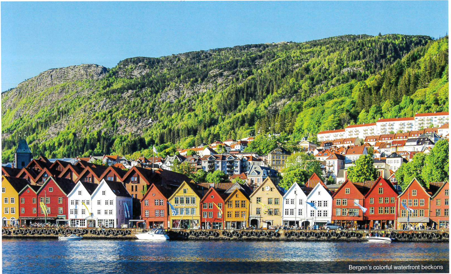
Bergen's colorful waterfront beckons